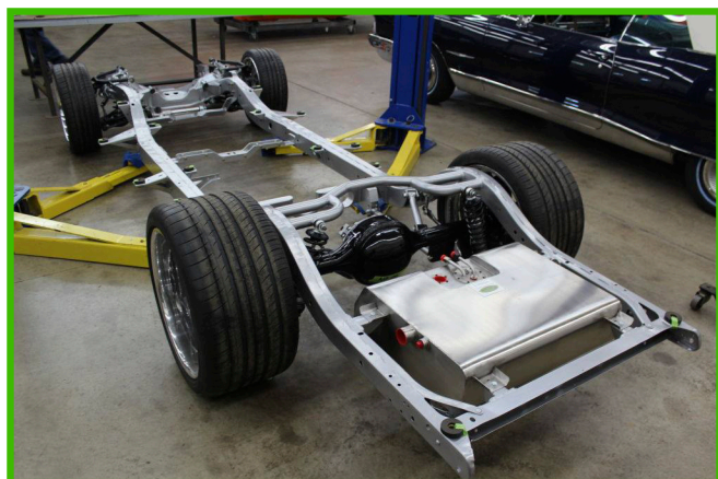
Stock OEM Chassis

The back brackets point forward in the chassis and front brackets point side to side. The main objective is to line up the fill tube and install the tank as high as possible with out touching the trunk floor. Brackets can be welded or bolted to the frame. Use 3/8 x 3.5 bolt if bolting to the frame. DO NOT use self tapping screws on brackets.