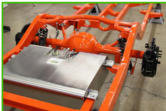
Art Morrison or Roadster Shop chassis